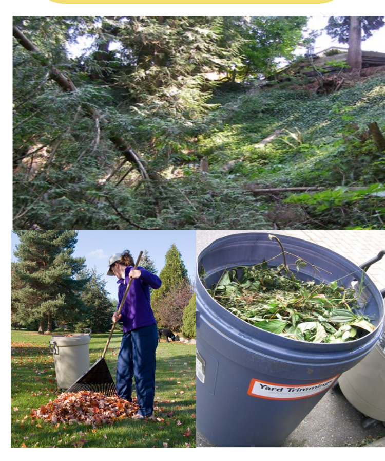
Help preserve Delta's important natural habitats from ravines to shorelines.

The Harmful Effects of Dumping Yard Waste