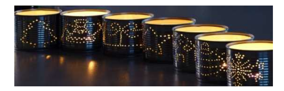
Luminary Festival 2022 September 10, 6-10pm Sunstone Park (10400 Delsom Crescent), North Delta