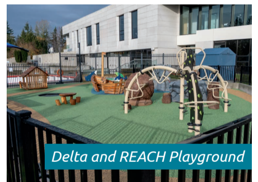
Delta and REACH Playground