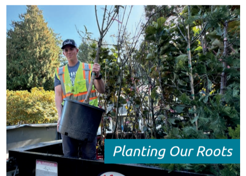
Planting Our Roots