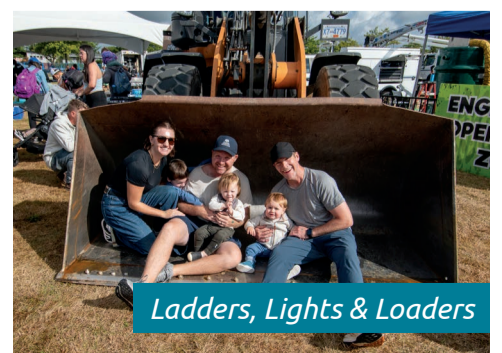
Ladders, Lights & Loaders