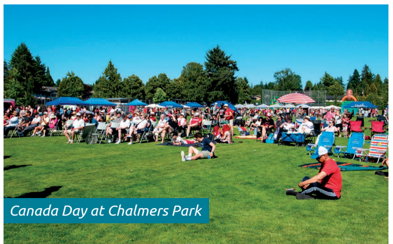
Canada Day at Chalmers Park