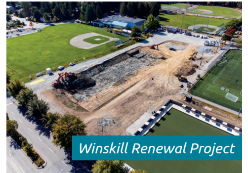
Winskill Renewal Project

The Ladner Village Market continued its popularity, drawing approximately 20,000 visitors per market, and a new North Delta Farmers Market launched at the North Delta Recreation Centre in the Social Heart. We look forward to another vibrant season ahead.