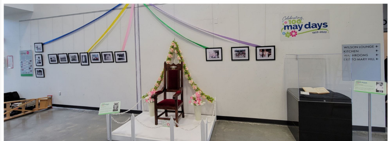
May Day photos digitised as part of this project on display around Port Coquitlam.

The results of our project have culminated in multiple public displays. Digitised photographs have been used by the City of Port Coquitlam on social media as well as on fencing and banners across the city, and PoCo heritage staff have been able to create two May Day exhibits for display in Port Coquitlam City Hall and the Port Coquitlam Community Centre.