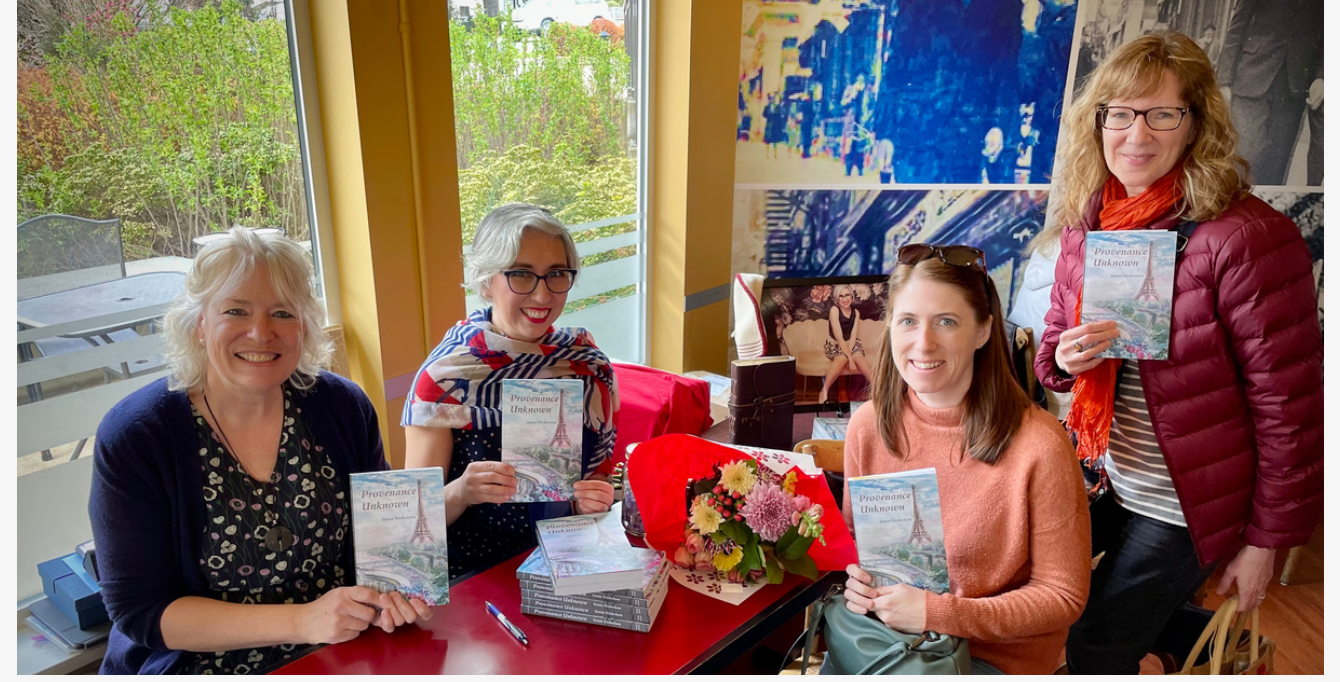
The Archivists Who Write at the Provenance Unknown book launch, 2 April 2023, in Victoria.

my day, and the ability to do what I loved: archival work and writing.